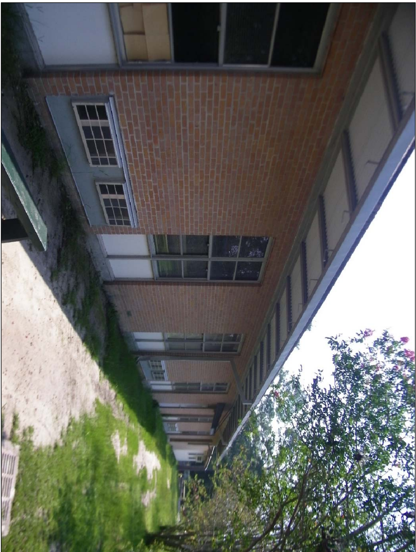
EXISTING BLDG. B. (#1978) ROOF PHOTOS N.T.S.